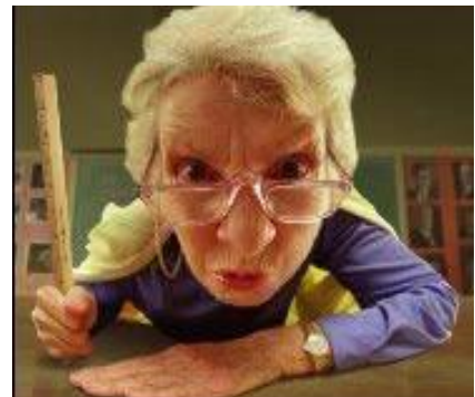
1 The teacher's rules were very rigid .