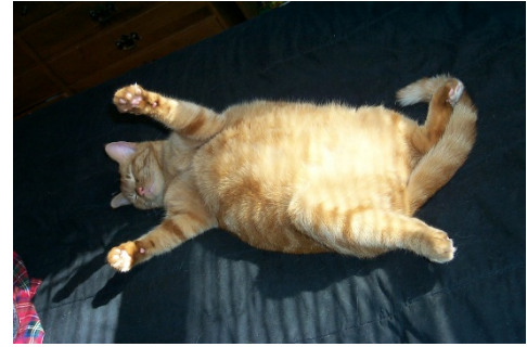
2 The large cat sprawled out on the bed.