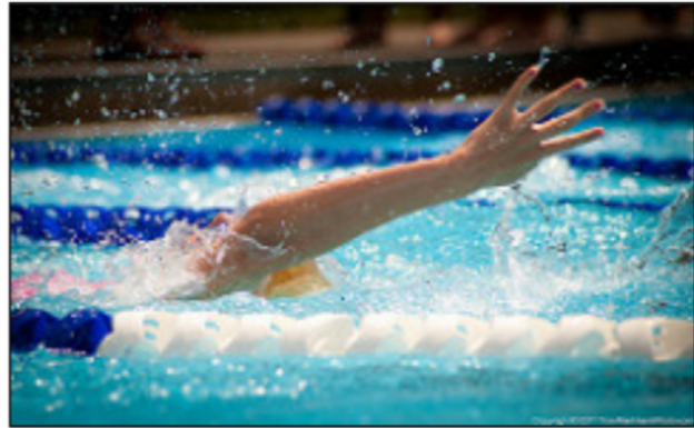
"Young girl swimming"

We stood in front of the mirror as she combed my hair, combed and brushed and smoothed.